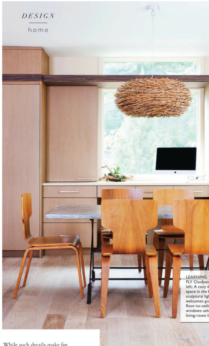
LEARNING TO FLY Clockwise from left: A cozy dining space in the kitchen; sculptural lighting welcomes guests; floor-to-ceiling windows usher in living-room light.